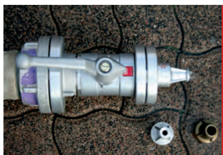
• Accessory kit Flowmaster DIGITAL.

The Flowmaster is your first choice at all points of water withdrawal whenever you need to precisely check the pressure and flow rate. Its integrated data logger stores up to 360 hours of data, and the digital indicators directly display the accurate measured values.